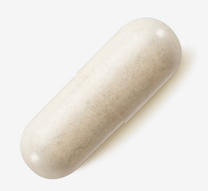
Each capsule contains: Vitamin C (L-ascorbic acid) from PUREWAY-C™ 500 mg